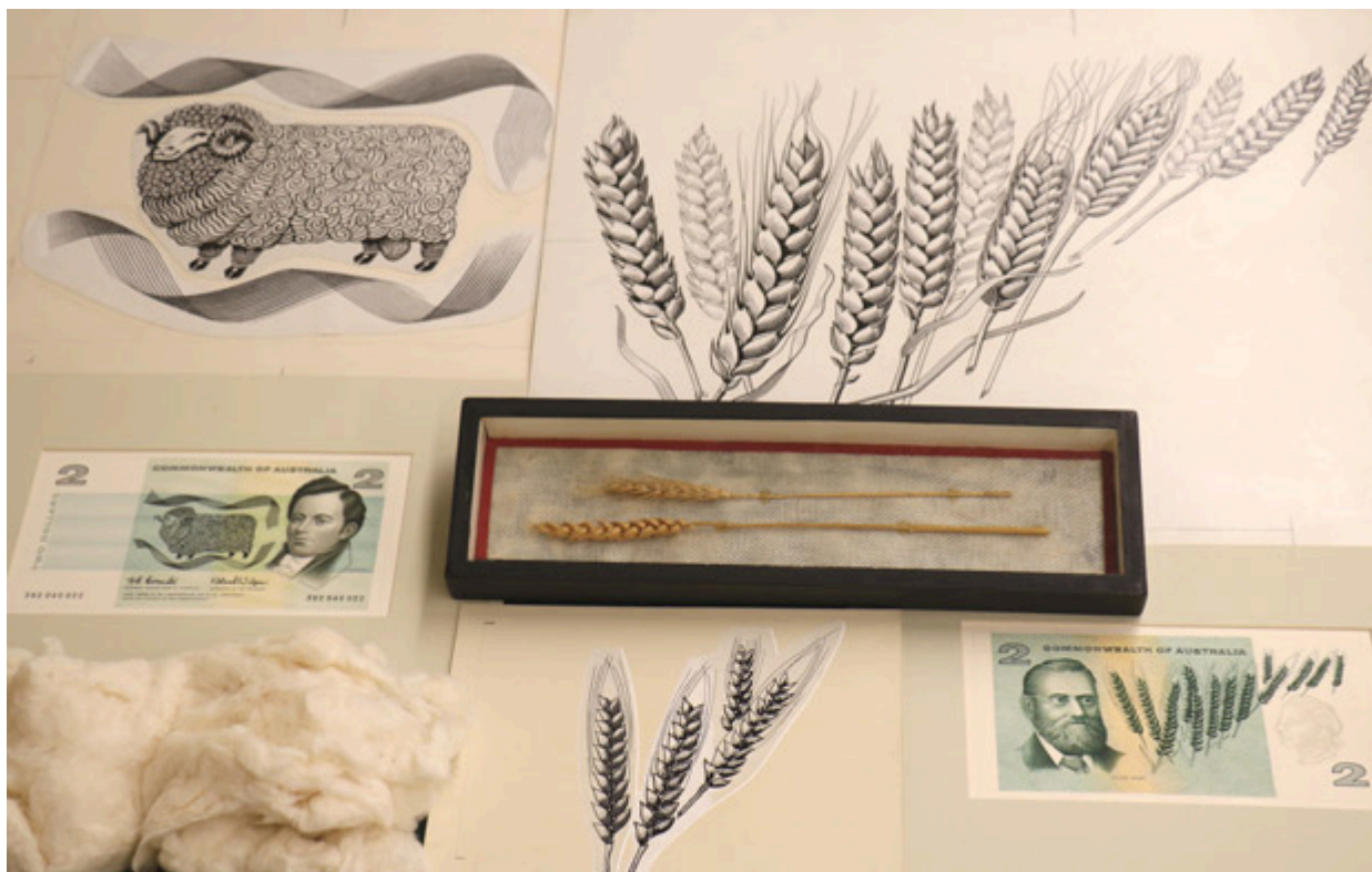
Figure 4: Design Elements for the $2 Banknote

Banknote design elements by Gordon Andrews, including original wool and wheat used to create images on the $2 banknote, along with early design concepts for the banknote.