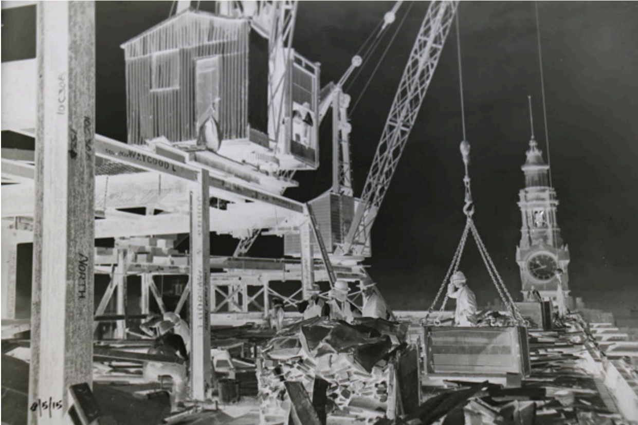
Figure 3: Glass Plate Negative Image of Martin Place Skyline, 1915

Commonwealth Bank Head Office, corner of Pitt Street and Martin Place (Moore Street), roof construction on 8 May 1915.