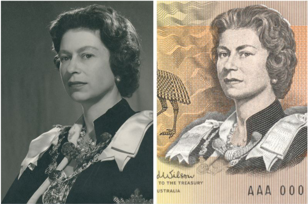
Photograph portrait of Queen Elizabeth II as supplied for the design of the $1 banknote.

As well as adding online exhibitions, Museum staff conducted virtual school holiday activities in which younger students designed their own banknotes. The exercise introduced students to aspects of Australian history and financial literacy, to ensure they could understand the key features of the money they handle.