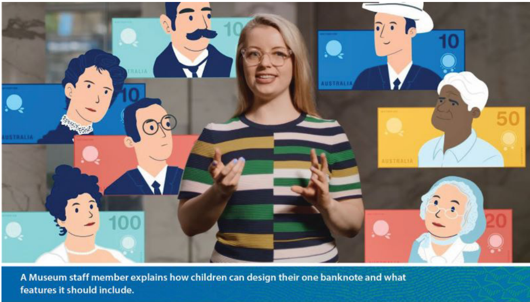
A Museum staff member explains how children can design their one banknote and what features it should include.