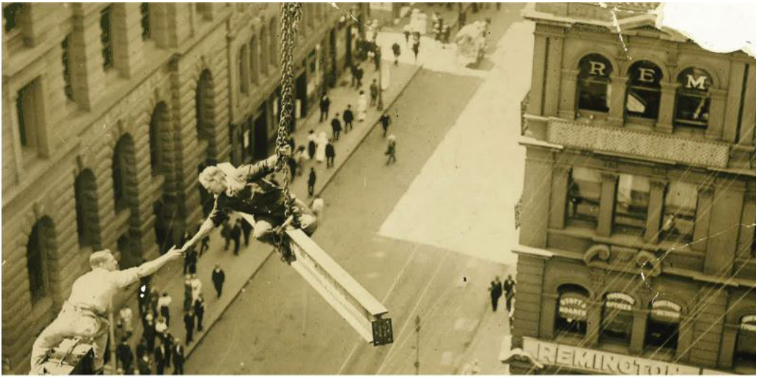
From the Reserve Bank's archival photographic collection, an image of the construction of the Commonwealth Bank of Australia's head office premises titled 'Lend us your hammer Jim', December 1914; RBA Archives PN-000685

While the pandemic has required the closure of the Reserve Bank's Archives repository and public research room, the archivists were able to support most requests for information remotely by accessing digital versions of records that were then shared with researchers using the Bank's secure external collaboration tool, RBA Box. They dealt with nearly 200 requests on a diverse range of topics, including family history, banknotes, sterling balances, colonial banking ledgers and images of Bank branches in the early 20th century. The archivists also continued to support the Bank's Historian, Associate Professor Selwyn Cornish of the Australian National University, who is at an advanced stage of documenting the 1975–2000 period of the Reserve Bank's official history.