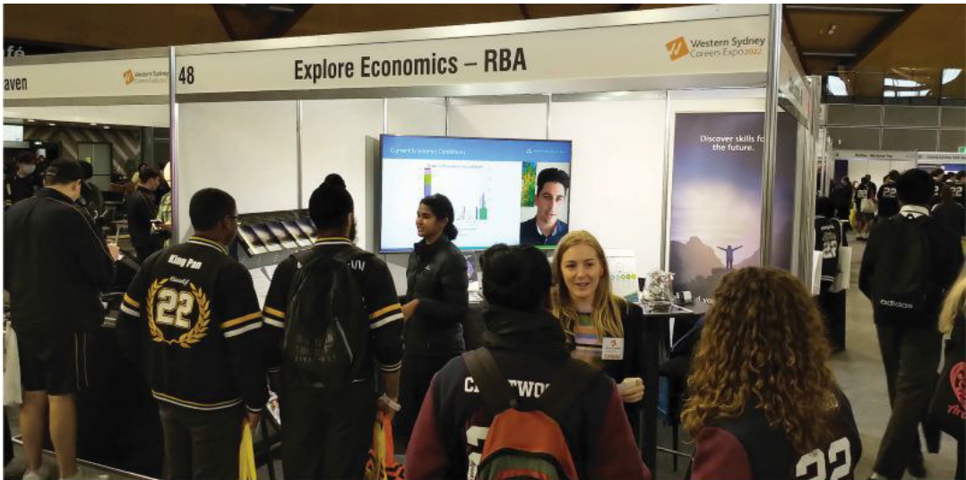
At the Western Sydney Careers Expo, students speak with Reserve Bank Ambassadors about studying economics.

The Reserve Bank continued to support educators through professional development activities. We hosted an online version of the Teacher Immersion Event, which included addresses by the Governor and Assistant Governor (Economic), presentations by Bank staff on core economic topics, practical sessions on how Bank content could be delivered in the classroom and a Q&A session with the Deputy Governor. Teachers from across the country attended – including, for the first time, teachers from as far afield as Broome in Western Australia and Charters Towers in Queensland. The Bank also continued its Topical Talks series, in which educators attend a lecture given by a senior Bank staff member on a topical economic issue relevant to Year 12 and undergraduate students. Key sessions of Bank-hosted professional development activities were filmed and made available on the Bank’s website for a wider audience. In addition, Bank staff presented at various professional development events hosted by peak teaching bodies and other education service providers.