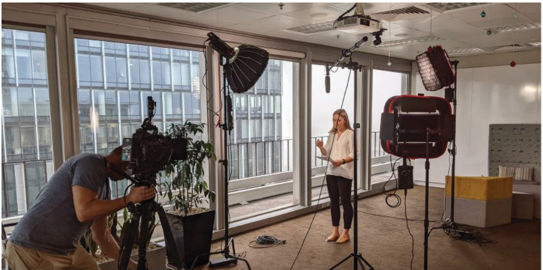
A Reserve Bank economist prepares to be filmed for the Explore Economics video series.

This past year saw the return of large-scale careers fairs, after a hiatus for much of the past two years because of the pandemic. As a result, in 2021/22 Reserve Bank staff participated in events attended by nearly 40,000 students. This provided an important opportunity for a large audience to gain exposure to economics and the Bank. Importantly, it allowed direct face-to-face engagement with students, with over 1,000 substantive discussions conducted with individual students about their subject and career choices.