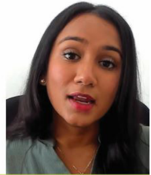
A Reserve Bank economist in a recorded talk for students and teachers on current economic conditions.