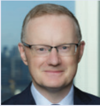
Governor Philip Lowe