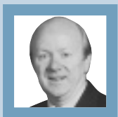
DEPUTY CHAIRMAN J F LAKER

Chairman since 1 July 1998. Governor of Reserve Bank of Australia. Present term expires 17 September 2003.