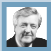
CHAIRMAN I J MACFARLANE

Chairman since 1 July 1998. Governor of Reserve Bank of Australia. Present term expires 17 September 2003.